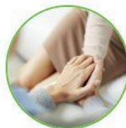
Mental Health Counseling