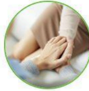
Mental Health Counseling