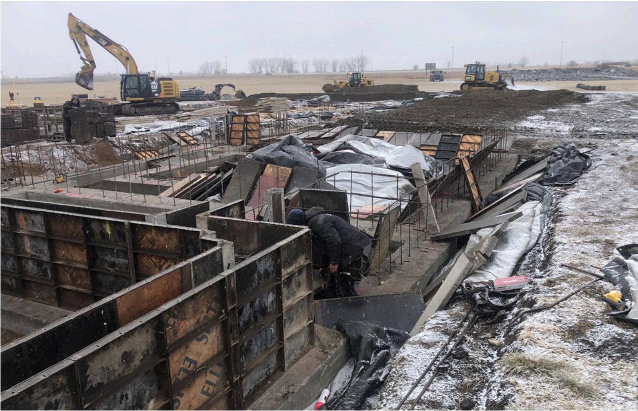
December 30, 2024: foundation walls poured, including the elevator shaft (in front of the workers).